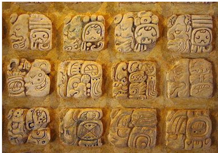
Maya glyphs in stucco at the Museo de sitio in Palenque , Mexico

(54 min, 2008, UM DULUTH Library Multimedia F1435.3.W75 C73 2008 DVD)